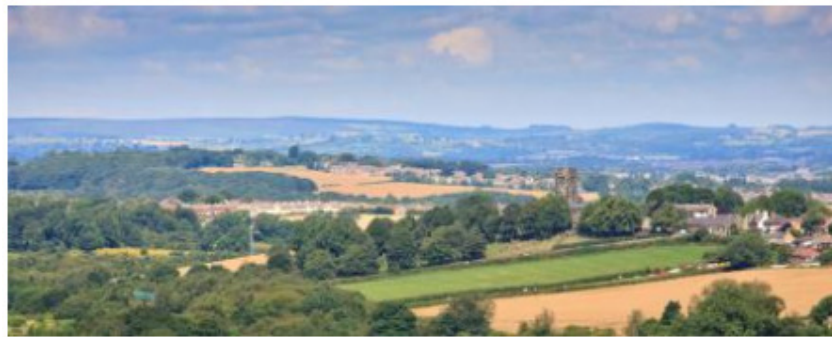
North East Derbyshire